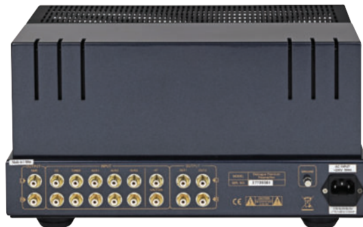
Line inputs through gold plated RCA phono sockets adorn the rear panel of the preamplifier and there are twin outputs.

Nigel Kennedy's Stradivarius had a lovely breadth of character, from resonant body to the rich, dense sound of the strings; this amplifier makes most others sound bleached in comparison. Nigel seemed to fiddle in space, as it were, as a lovely sense of atmosphere pervaded the performance supplied by ambience