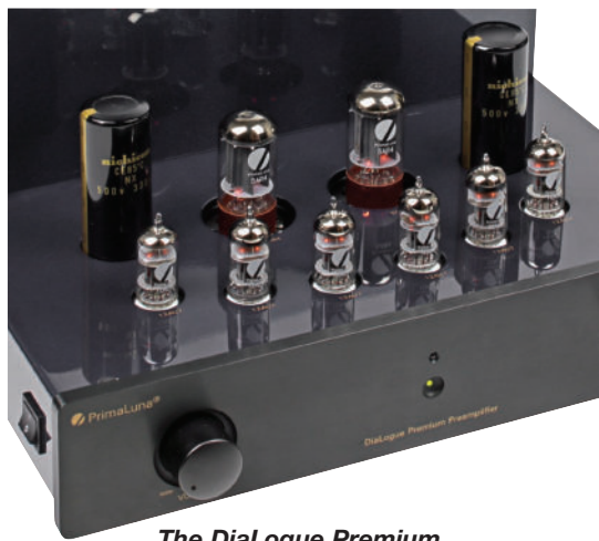
The DiaLogue Premium Preamplifier has two valve rectifiers, seen at rear.