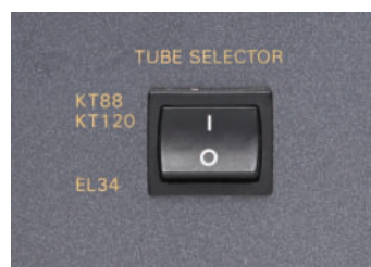
A side-mounted rocker switch changes bias to suit EL34s, KT88s and even KT150s PrimaLuna say.

I paired the PrimaLunas with Quadral's new Rodan 9 floorstanding loudspeakers reviewed in this issue, as well as our in-house Martin Logan