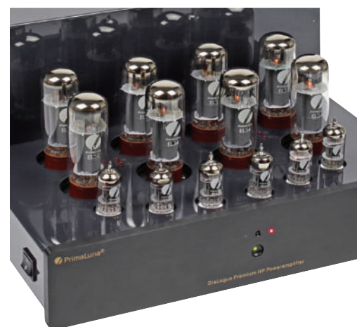
For high power, the output stage uses parallel push-pull pairs of EL34 power valves on each channel, seen at rear.