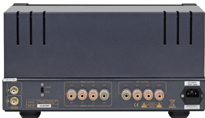
The stereo power amplifier has 4, 8 and 16 Ohm loudspeaker outputs, via sturdy gold plated terminals that accept 4mm banana plugs, spades or bare wires.

EL34 power valves in push-pull pairs, four per channel – eight in all. I mention this because valve replacement cost is an issue for some, as it can be if you're looking at 300Bs, for example, that cost up to £300 apiece. EL34s are plentiful and can be had at £60 or thereabouts for matched quads (i.e. 4), so a complete re-valve after 2000 hours or so – many years of use – is around £120.